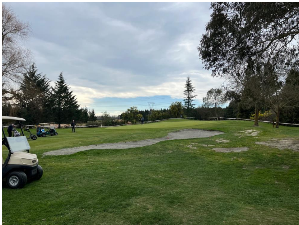
View across the 14 th green from the top of the 15 th White tee Block

If your ball ends up in the work area, treat it as GUR (unless you're out of bounds on 14 of course). We'll update you more on plans for these areas once the works complete and we've had a better look at it all.