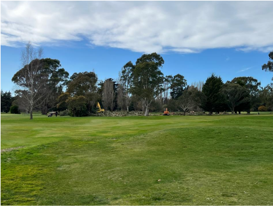
The gums on the right hand side of the 10 th hole