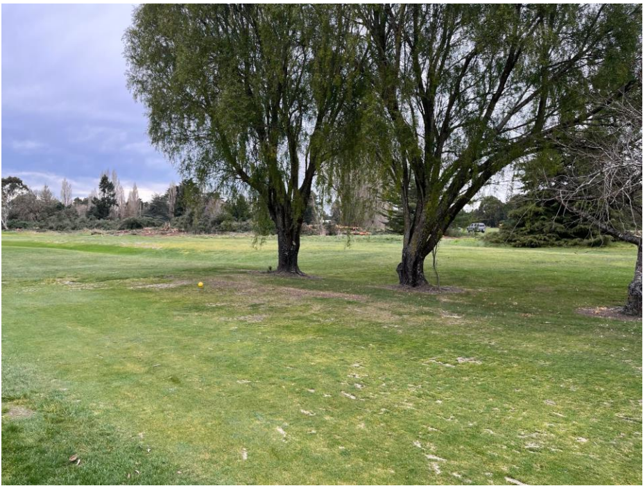
View across the 15 th fairway, again from the 15 th White tee Block