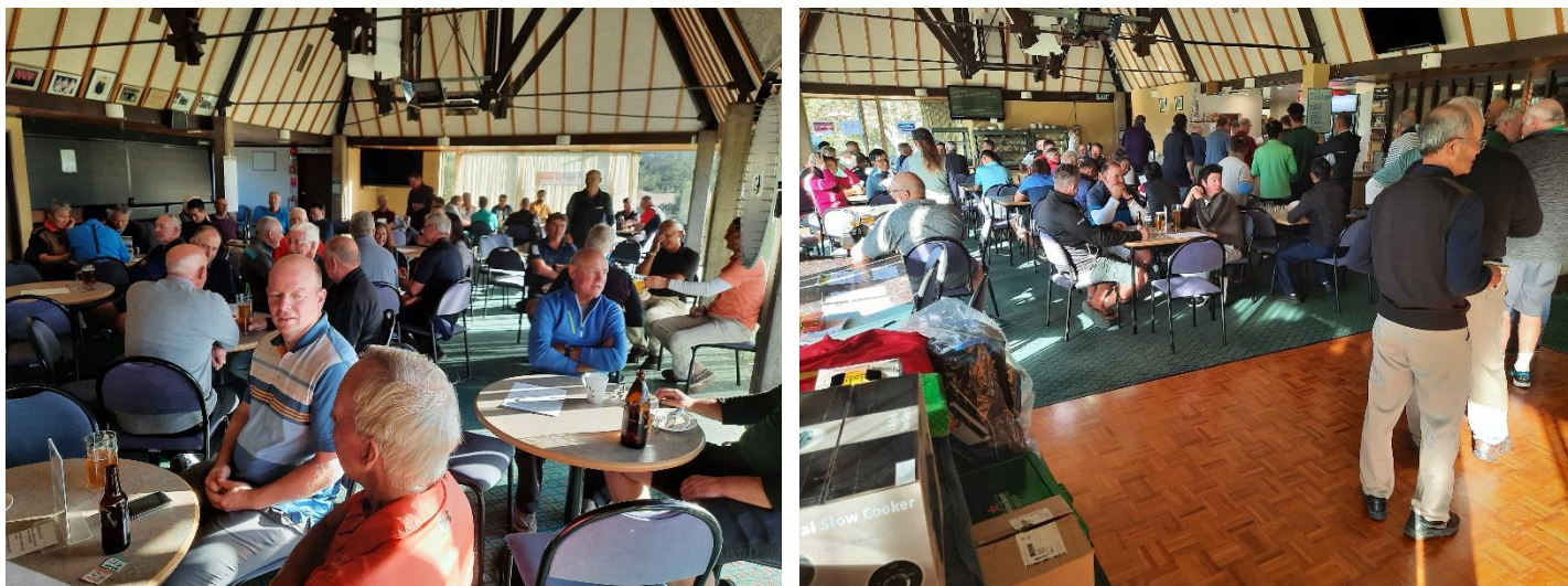
A Full Clubhouse

Last Saturday was 'The Lone Star & Joes Garage Group and New World Bishopdale Co-sponsored Coringa Open, for the Women off the Yellow tees and Men off the Blue tees. It was a